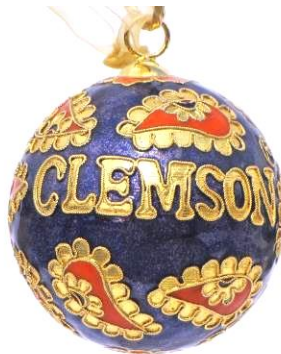
#6524-O Reverse Paisley