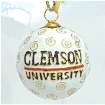
#2865-O White Round Original