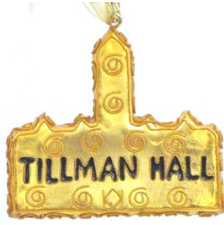
#6940-O Tillman Hall