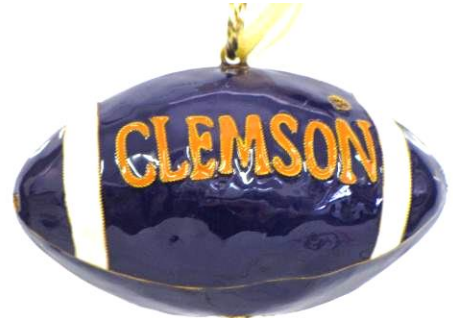
#5007-O 3-D Football