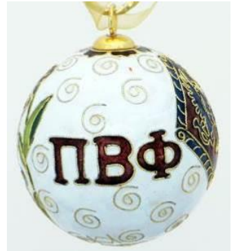
#1570-O White Round Original