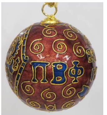
#5165-O Colored Background Round Original