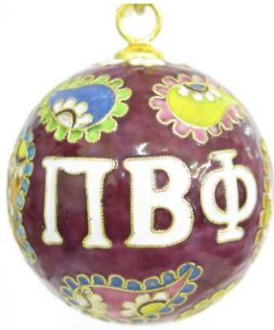
#7500-O Multicolored Paisley