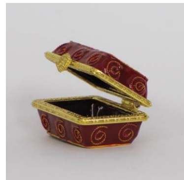
#3992-B Mini Pin Box

THESE ARE ORIGINAL DESIGNS BY KITTY KELLER DESIGNS, LLC. ALL RIGHTS RESERVED Without reservation, no portion of this design, in whole or in part may be reproduced in any form, without the express permission and consent of Kitty Keller Designs, LLC.