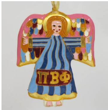
#3994-O Angel Mascot