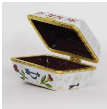
#3227-B Rectangular Box